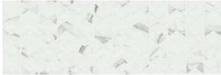
Tip Status 40 x 120 cm. WB4012RB