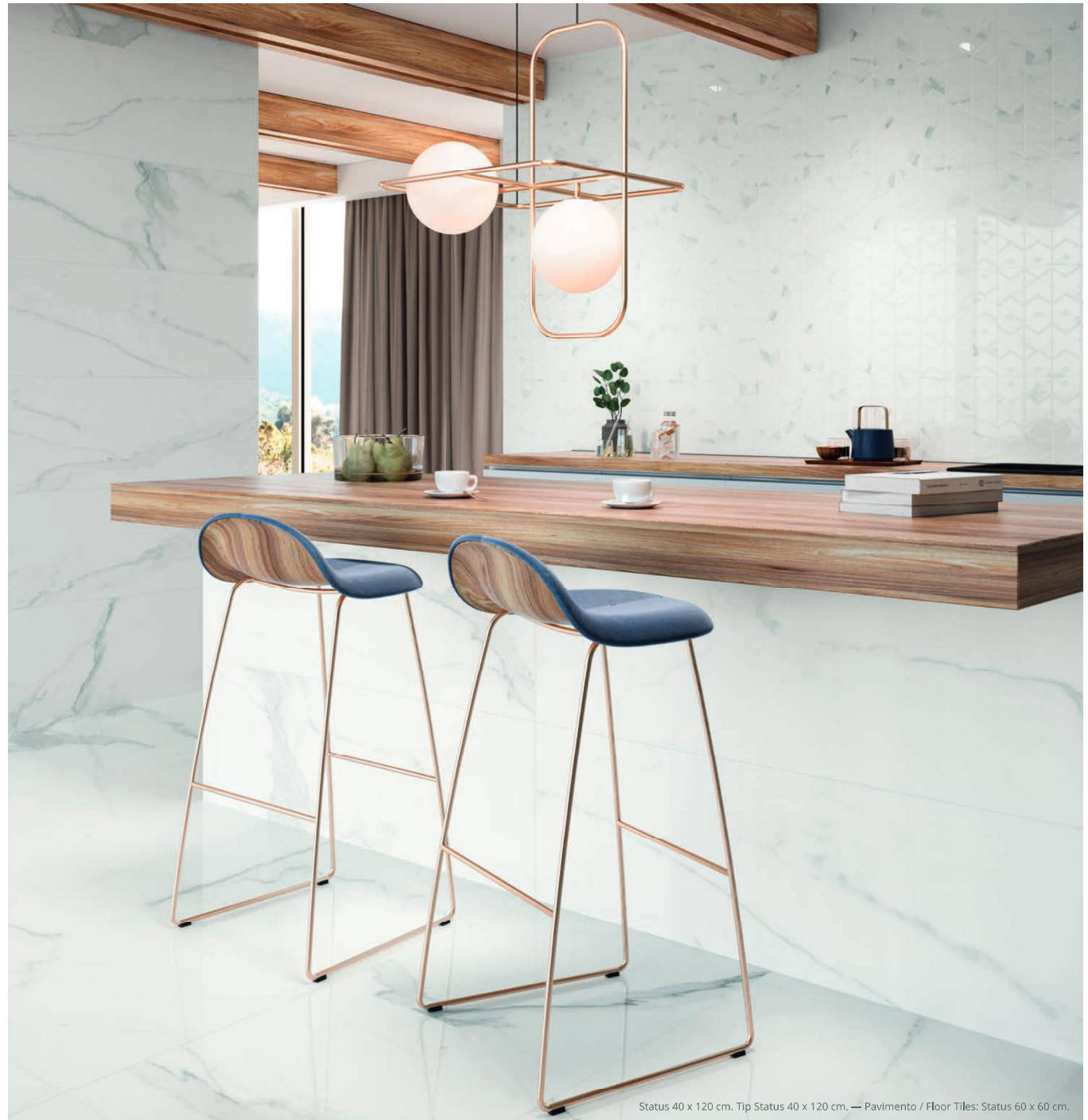
Status 40 x 120 cm. Tip Status 40 x 120 cm. — Pavimento / Floor Tiles: Status 60 x 60 cm.