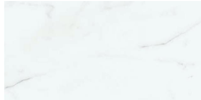
Status Pulido 60 x 120 cm.