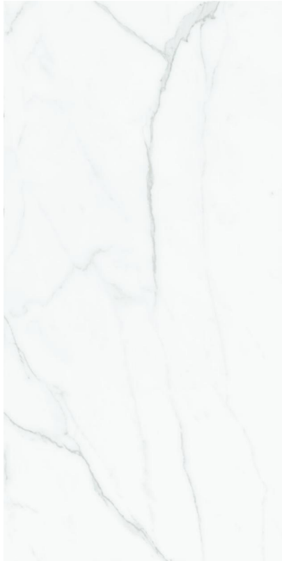
Status P Natural 240 x 120 cm.