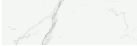
Status 40 x 120 cm. WB4012R