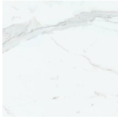
Status Pulido 120 x 120 cm.