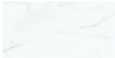
Status Natural 60 x 120 cm.