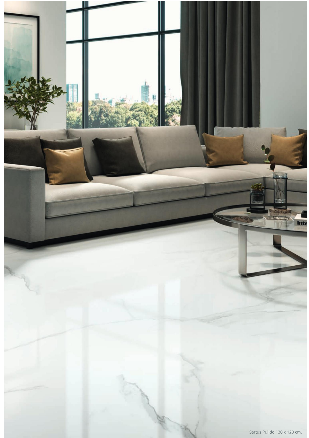
Status Pulido 120 x 120 cm.